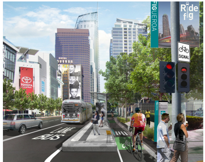
The MyFigueroa streetscape project opened in August 2018.